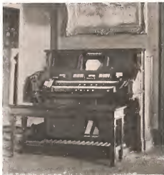
AN ORGAN WITH A HISTORY

Everyone who knew the internationally famous Dr. Charles H. Mayo, of Rochester, Minnesota, knew that he insisted upon spending an hour a day at the organ installed in his home in 1912 because the world's most famous surgeon found a release from his daily strain through music that he could find nowhere else. He told the Editor of The Ende that one of the privations of his life was that he had never had a musical training, and was obliged to depend upon an automatic player. This picture shows the console only. The organ itself was in the basement of Dr. Mayo's home.